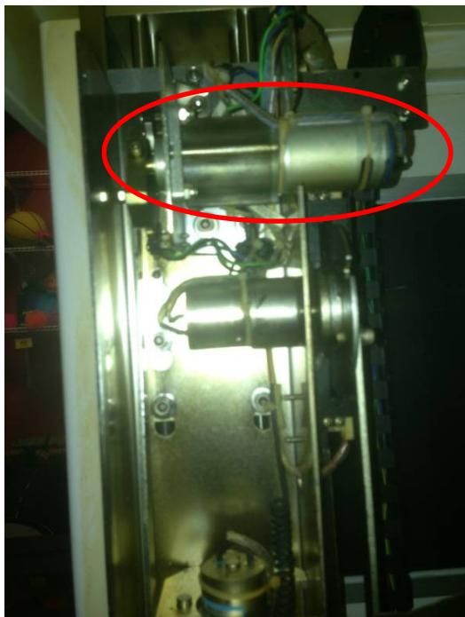
Vendor Arm Pusher Broken

Even if the motor works by direct DC 12V provided, you have to make it run harder, using some item or force as resistance in order to make sure the motor gear wasn't damaged.